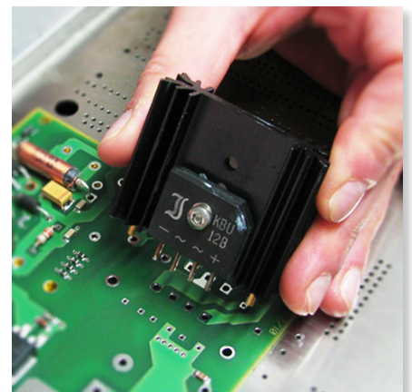
Fig. 2: THT assembly